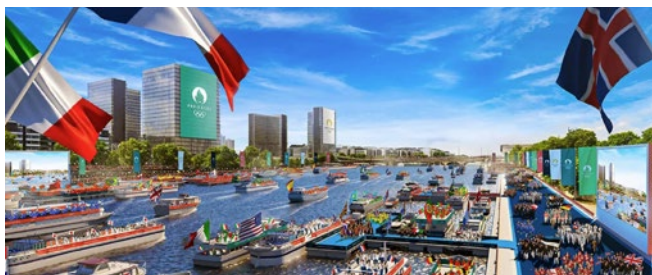
The Olympic Games 2024 on the Seine River

What a great advertisement for our activity!