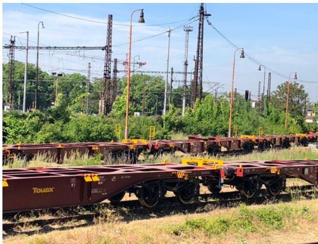
6-axle Sggrss 80' wagons

However, thanks to the quality of our service and our diversified fleet, which can meet the needs of a large portfolio of customers, Touax Rail 's activity grew by 5.4% in the first quarter, driven in particular by leasing income generated by volume growth in the automotive segment.