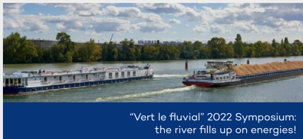
"Vert le fluvial" 2022 Symposium: the river fills up on energies!

Clément Beaune, French Minister of Transport, was among nearly 250 participants from the river ecosystem. Touax River Barges had the opportunity to present its activities and services for the benefit of energy transition logistics.