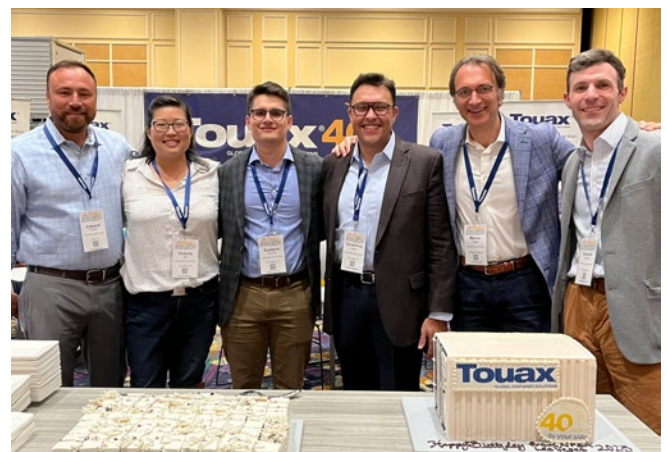
Touax Container American team at NPSA Conference, Las Vegas in April